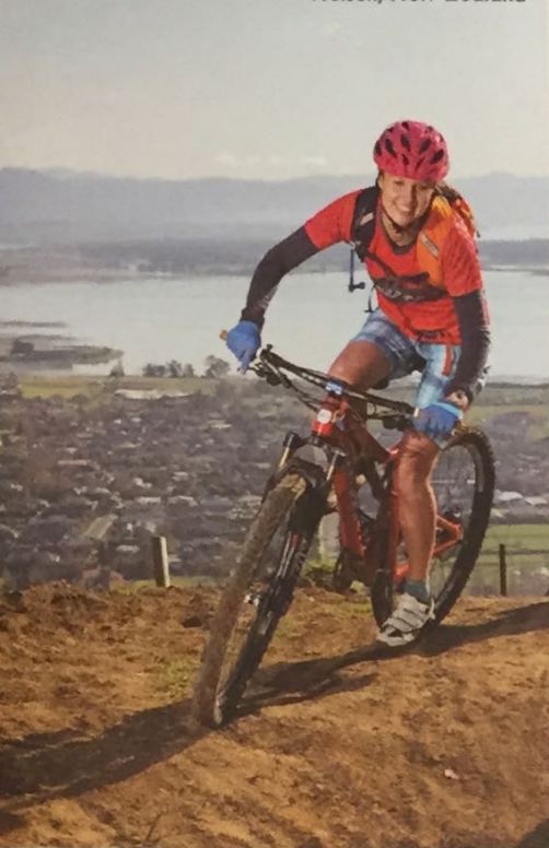
Nelson, New Zealand