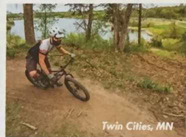
Twin Cities, MN